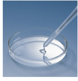
Highly viscous media