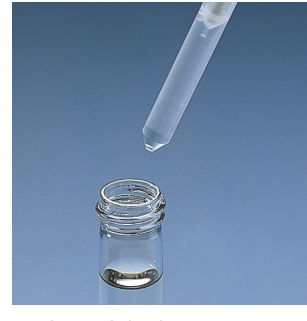
Media with high vapor pressure