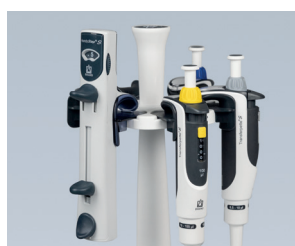
The rack mount also fits the Transferpette® S bench-top rack.