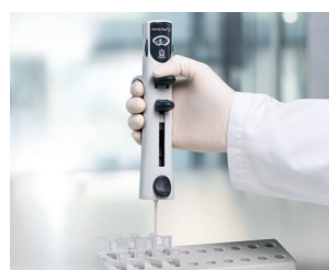
Dispensing small volumes