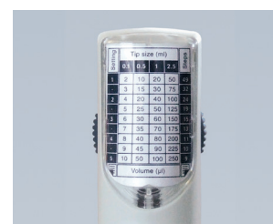
Fast volume selection with the volume table on the back side