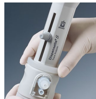
Easy replacement of the complete dispensing unit without tools – dispensing unit is fully adjusted.