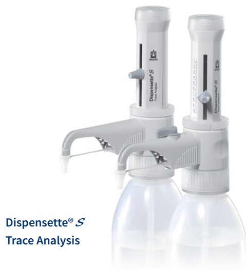
Dispensette® S Trace Analysis