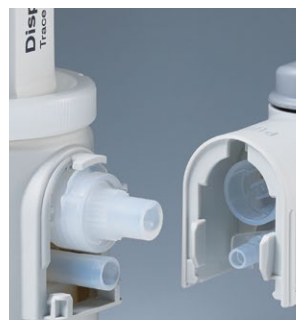
Valve system designed without seals