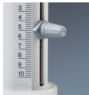
Positive volume setting using interior scalloped track