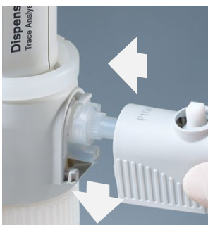
Simple-to-mount discharge tube

The above recommendations reflect testing completed prior to publication. Always follow instructions in the operating manual of the instrument as well as the reagent manufacturer's specifications. Should you require information on chemicals not listed, please feel free to contact BRAND. Status as of: 0815/2