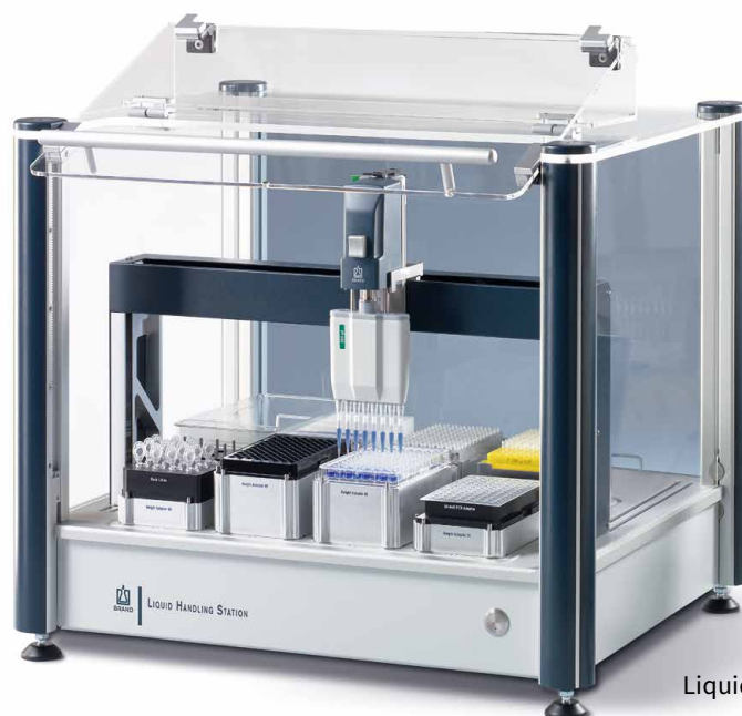
Liquid Handling Station